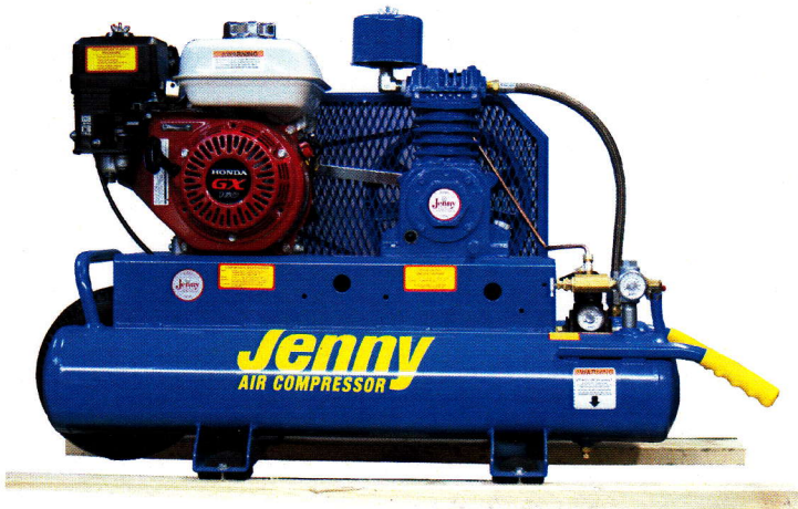
Model - K5HGA-8P CFM @ 100psi - 8.9 5.5 HP Honda Engine